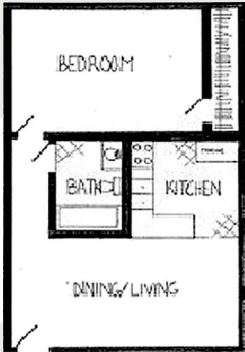
A1 1 Bedroom / 1 Bath - 575 Sq. Ft.*