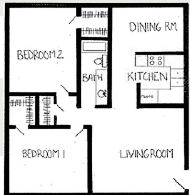
2 Bedroom / 1 Bath - 998 Sq. Ft.*